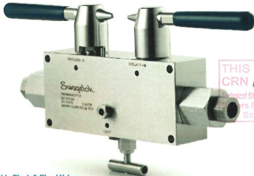
Double Block & Bleed Valves

THIS IS PART OF CRN 0C18171-5 Technical Standards & Safety Authority Pipes & Pressure Vessels Safety Program